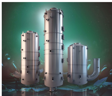
TECO Future Funnel

Slåttland operates in Offshore and Marine, Hydrogen and Wind Power, Carbon Capture, Energy and Industry. The company has for 30 years been a provider for competence based solutions for demanding partners. It is the chosen partner for the mechanical and technical contributions to the pilot project Deep Purple, lead by TecnipFMC, which develops green hydrogen offshore energy systems. The Group also has a production and engineering office in Vietnam.